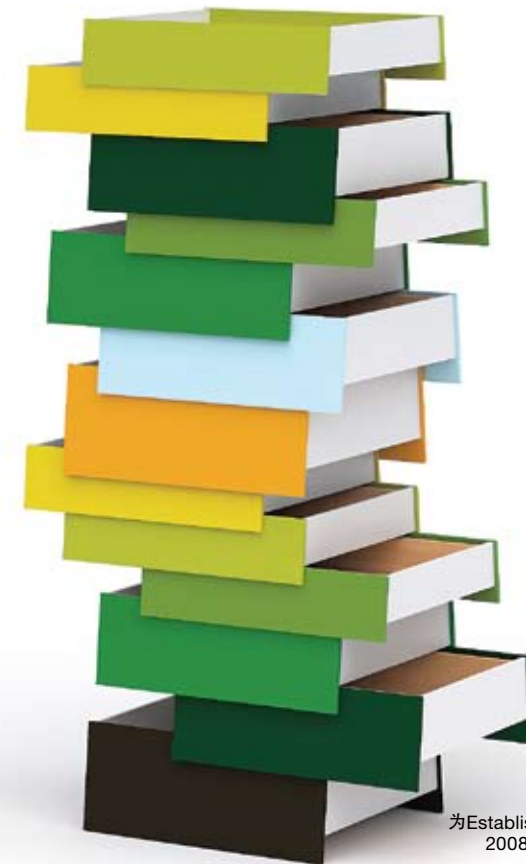
Stark: 为Established&Sons 2008米兰展设计

Raw-edges: To have as many dogs as possible!